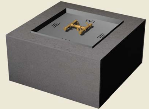
FS3636 - 36" Square Fire Pit Kit shown with the MLS60 burner. Other burner options available.